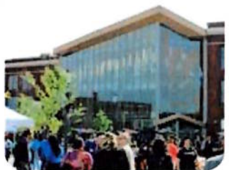
Aspire Center for Workforce Innovation in Austin