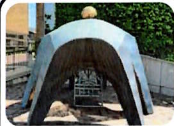
Geraldine McCullough's "Pathfinder" Sculpture at Village Hall in Oak Park