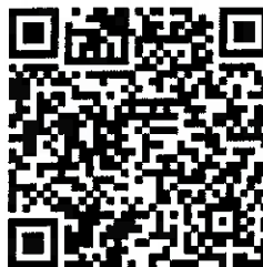
Read more about each of these places at: collab4kids.org/bh-bingo