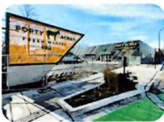
Forty Acres Fresh Market in Austin