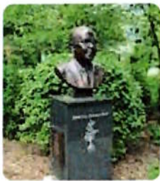
Bust of Percy Julian Scoville Park, Oak Park

Explore these local places with your little ones and discover Black history, creativity, resilience, and stories!