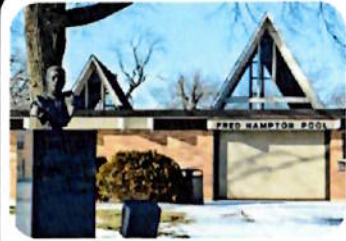
Fred Hampton Aquatic Center in Maywood