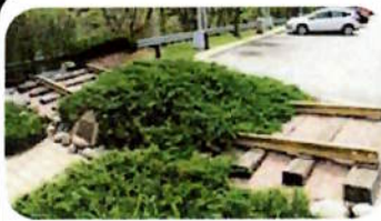
Underground Railroad Memorial honoring the site of the Ten Mile Freedom House in Maywood